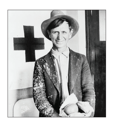
Drought-stricken farmer http://www.loc.gov/item/90714876/